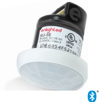
Micro Sensor, 8-pin

Driver Compatibility: Dimming and on/off control signaling for standard 0-10V ballasts and drivers using linear dimming curve for LED and fluorescent light fixtures.