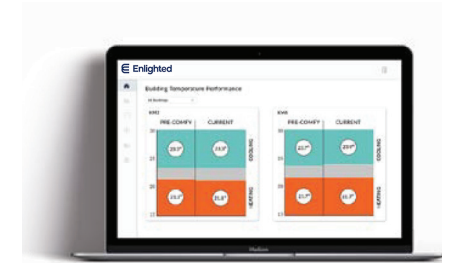
Building Temperature Performance