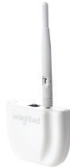
The Enlighted Gateway

Operating Range: Each Gateway can operate at a 150 ft. radius (46 m) open range in open ceiling installation, and individual sensor units can function as repeaters to extend operating range.